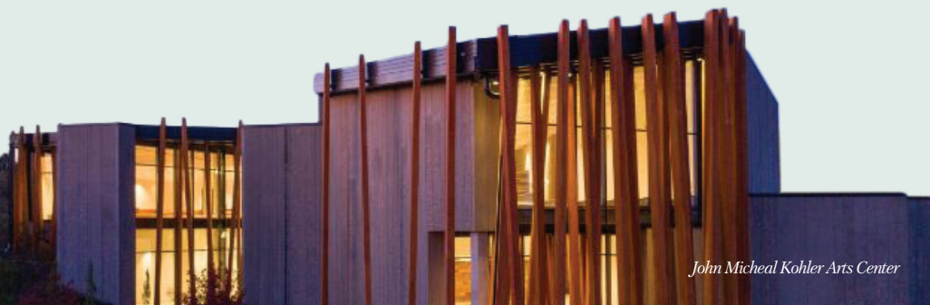
John Micheal Kohler Arts Center

Going out with a bang — cocktail in hand! Come for a night of flamboyant fashion, art, music, bites, and booze to celebrate the closing of major exhibitions.