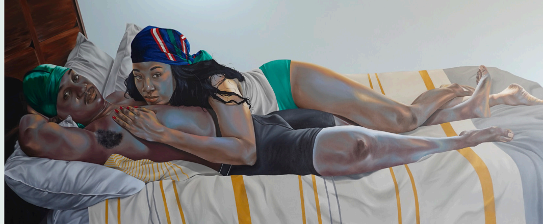
Robert Peterson, Sunday Kind of Love , 2022. Oil on canvas, 54 x 114 inches. Collection of the Wichita Art Museum.

These intimate conversations feature artists whose works were recently acquired for WAM's collection. Each conversation features a reception at 5:30pm to celebrate our local creatives, in partnership with Harvester Artists. Following the conversation, enjoy an invitation-only optional dinner for Ambassadors level and above.