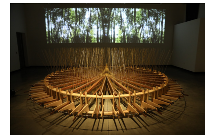
John Douglas Powers, Locus , 2015. Oak, poplar, steel, brass, plastic and electric motor with two channel video projection, 4 x 22 x 22 feet, Photo courtesy John Douglas Powers.